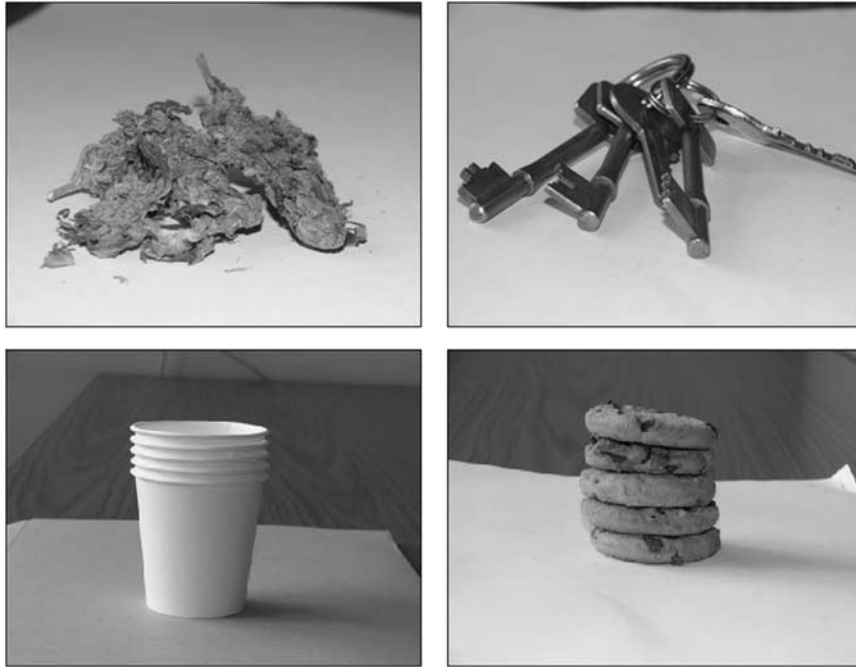
Figure 1 An example of a cannabis/neutral and a food/neutral-matched pair of images.

tap automatic (250 ms) and controlled (2000 ms) processing. The critical (food- or drug-related) images appeared once on the left and once on the right at each time interval. The side at which the probe appeared was counterbalanced across all the trials. An asterisk was used as the probe.