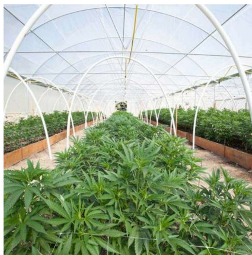
Figure 1. Cannabis plants being grown and cultivated in a legal cannabis farm.

THC is a lipid found in all aerial parts of the cannabis plant (Figure 1) but most abundant in the flowers of the female plant, particularly the cannabis sativa species. At room temperature, THC is a glassy solid with the molecular formula C_{21}H_{30}O_2 [29]. THC is soluble in lipids and solvents but has weak solubility in water [30]. THC is psychoactive and reacts with endocannabinoid (EC) receptors found in the brain, causing mood changes, euphoria and the commonly known “high” feeling [31].