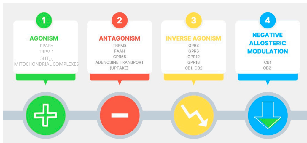
Figure 2. Pharmacological targets potentially involved in cannabidiol effects. 5-HT 1A = serotonin 1A receptor; PPAR- \gamma = peroxisome proliferator-activated receptor gamma; TRPV-1 = transient receptor potential cation channel subfamily V member 1; TRPM8 = transient receptor potential cation channel subfamily M (melastatin) member 8; FAAH = fatty acid amide hydrolase; GPR55 = G protein-coupled receptor 55; GPR3 = G protein-coupled receptor 3; GPR6 = G protein-coupled receptor 6; GPR12 = G protein-coupled receptor 12; GPR18 = G protein-coupled receptor 18; CB1 = cannabinoid receptor type 1; CB2 = cannabinoid receptor type 2.